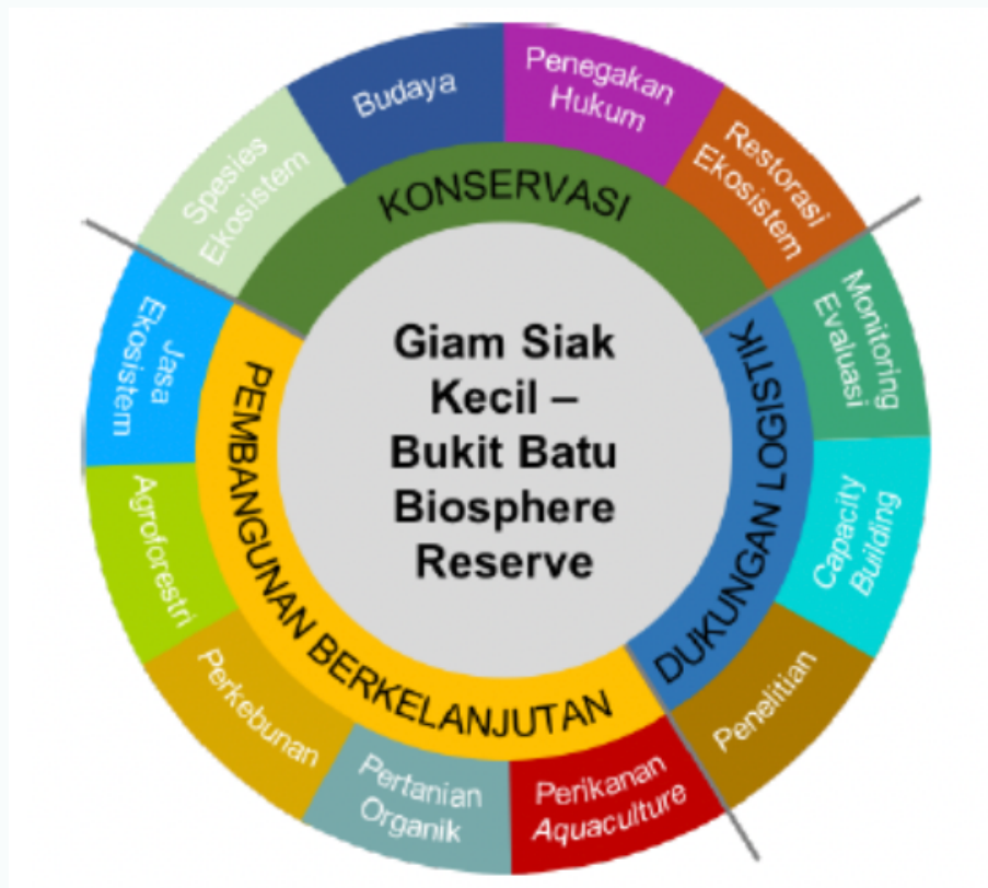
Diagram 1. Program direction for GSK-BR program 2018 - 2022

The guidelines cover several main output topics, namely: