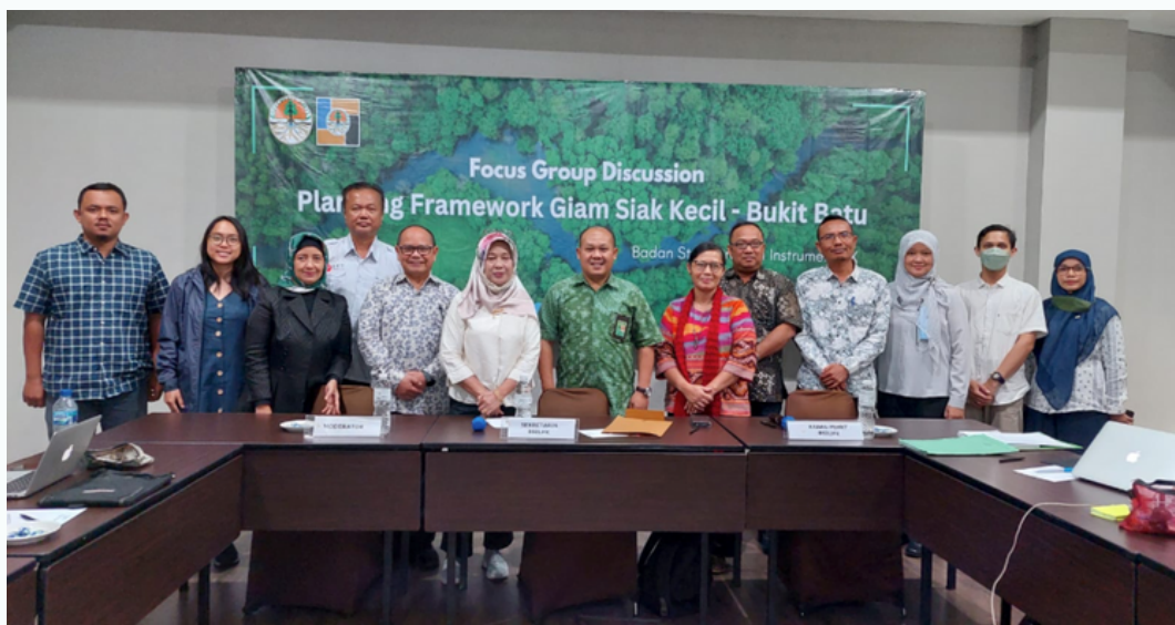
[Photo 1. Photo session with participants of the FGD Planning Framework Giam Siak Kecil Bukit Batu Biosphere Reserve]