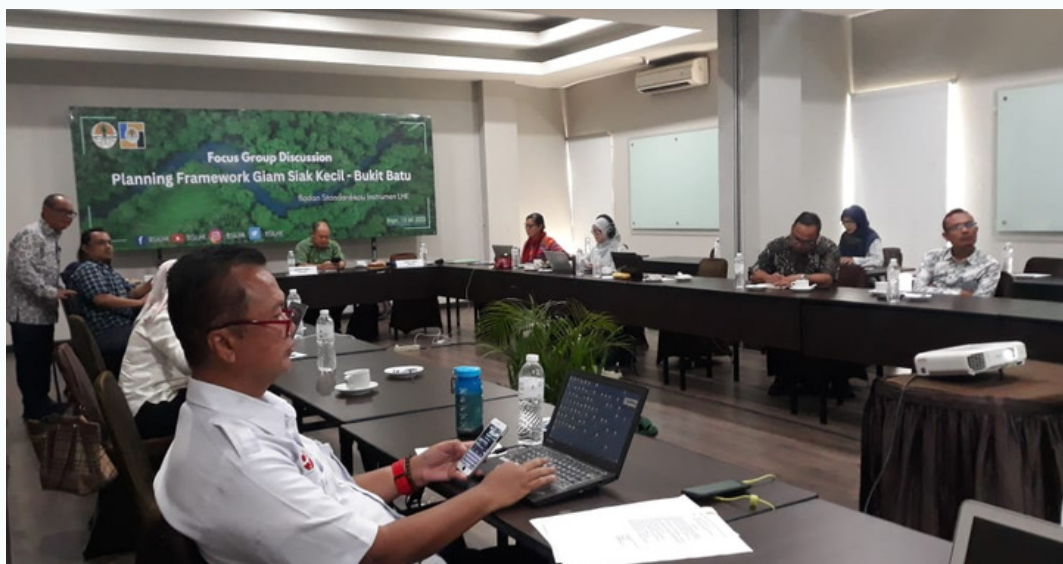
[Photo 3. The ongoing FGD, participants conveying input and suggestions for the Planning Framework for Giam Siak Kecil Bukit Batu Biosphere Reserve]